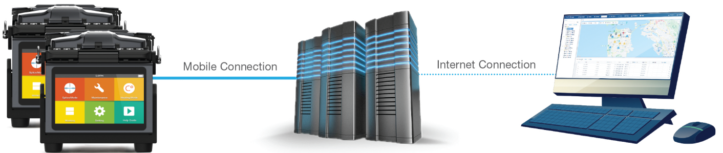
INNO's Pro Series Splicers

View Pro Management System is an integrated cloud-based software platform for INNO's splicers. This innovative web-based application allows both technicians and managers of the splicers to maximize the use of its assets and to achieve the highest work efficiency. Real-time communications with tiered access rights and options to manage job orders, manage splicing machines, and send/receive reports are only a small part of the innovative work processes offered by the View Pro.